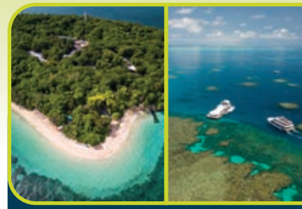
Green Island and Great Barrier Reef Adventure

The ultimate Island & Reef day. Includes 2 hours on Green Island + 3 hours at Great Adventures Moore Reef platform.