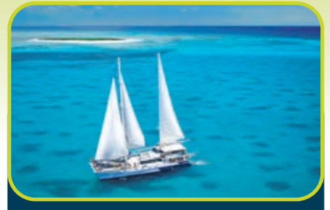
Ocean Spirit Michaelmas Cay Cruise

Sail, snorkel, dive and relax. A day as active or as relaxed as you choose at the picturesque sand cay of Michaelmas Cay.